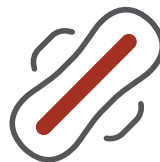
Vaginal bleeding soaking through more than 1 pad, 1 hour after pregnancy