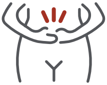
Persistent, severe belly pain

Remember to say that you're pregnant or have been pregnant within the last year.