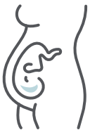
Stopped or slowed fetal movements