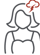
Thoughts of hurting yourself or your baby

If you experience these symptoms during or after pregnancy, contact your health care provider to get help right away. If you can't reach your physician, go to the emergency department.