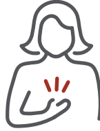
Chest pain or rapid heartbeat