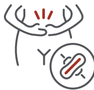
Vaginal bleeding or fluid leaking during pregnancy