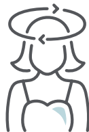
Persistent headaches, dizziness, or fainting