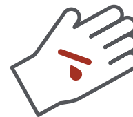
A non-healing incision