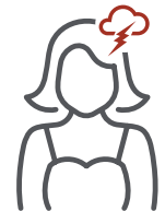
Scary or upsetting thoughts that won't go away