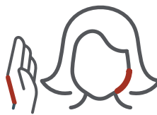
Extreme swelling in your hands or face