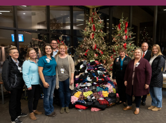
Warm and Thankful 2019 Donations