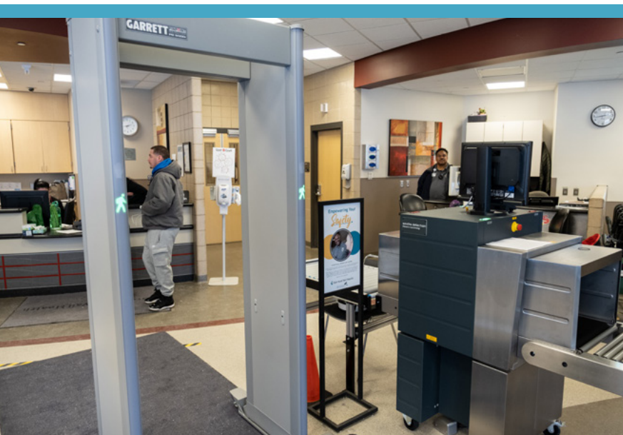
Emergency Department Metal Detector

Gemba walks are an important tool leadership uses to better understand safety and quality concerns. In 2019, we averaged four Gemba walks per week, equating to more than 650 hours leadership dedicated to listening and learning. During Gemba walks a diverse group of people come together to observe how we can improve both safety and quality in all departments. It is our goal to offer improvements shortly after these walks to lead to a better Stormont Vail Health.