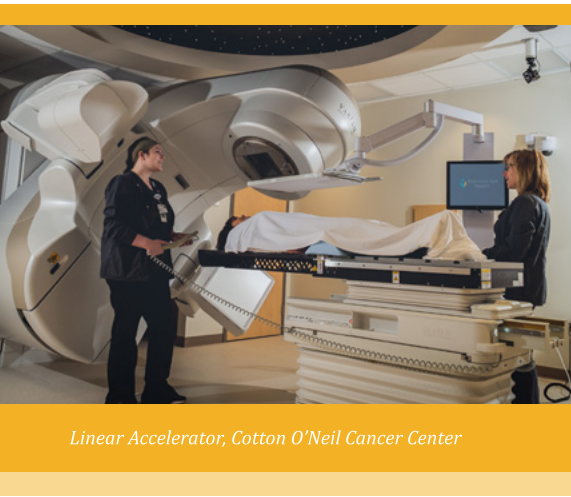
Linear Accelerator, Cotton O'Neil Cancer Center